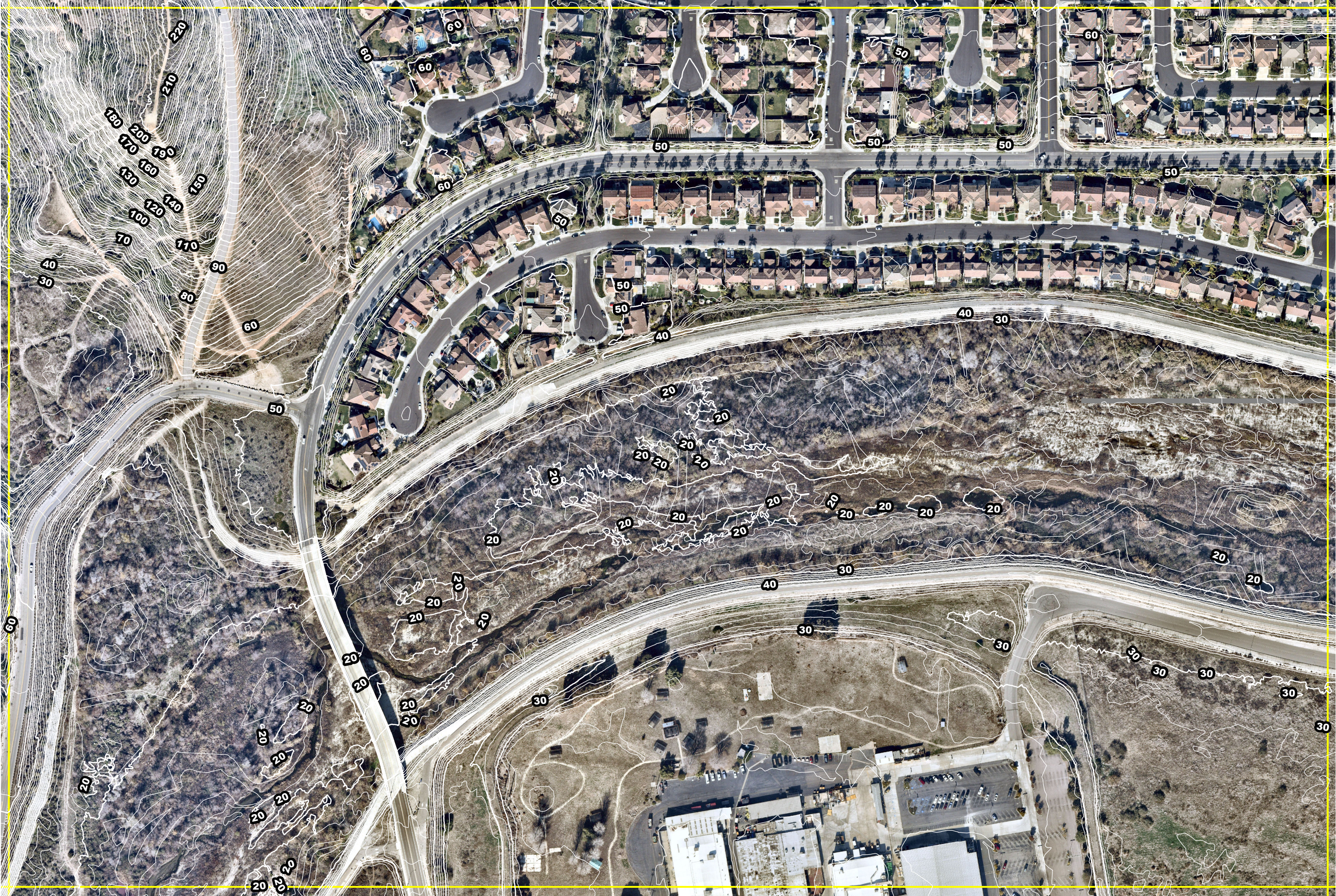
Map No. G18

- SOURCE: NEARMAP ORTHOPHOTO 2021 AND USGS 2014 CONTOURS - THIS MAP IS PREPARED SOLELY FOR ILLUSTRATION PURPOSE. USE OF CITY TOPOGRAPHY FOR ENTITLEMENT OR FINAL ENGINEERING IS STRICTLY PROHIBITED. ANY ENTITLEMENT OR FINAL ENGINEERING PROJECT SUBMITTED USING CITY TOPOGRAPHY WILL NOT BE APPROVED. TOPOGRAPHY FOR ANY PROJECT SHALL BE LESS THAN ONE YEAR OLD. - SOME INFORMATION MAY NOT BE ACCURATE.